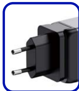
EU Type C