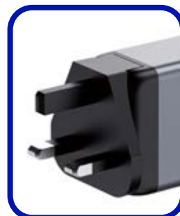
UK Type G