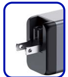
US Type A